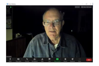
Live Chat is optional.