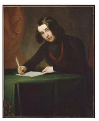
Charles Dickens (1842)